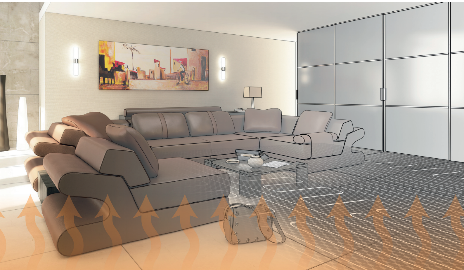
Underfloor heating in a living room