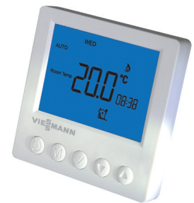
Programmable room thermostat