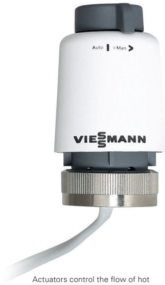
Actuators control the flow of hot water around the underfloor heating circuit