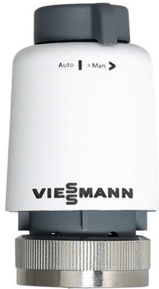
Actuators control the flow of hot water around the underfloor heating circuit