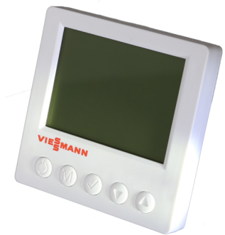
Programmable room thermostat