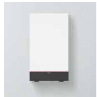
Vitodens 025-W (type BPKB)