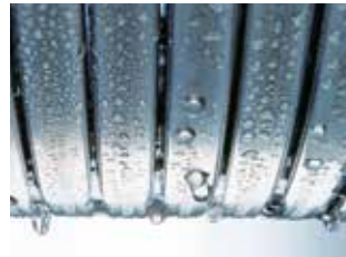
Inox-Radial heat exchanger

Stainless steel makes all the difference. The corrosion-resistant, stainless steel Inox-Radial heat exchanger plays a crucial role within the Vitodens 025-W. It efficiently converts the input energy into heat. In addition, the particularly durable, high grade stainless steel ensures reliability.