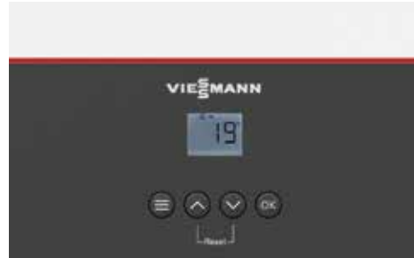
LCD screen with white backlight and 4 buttons

The heating water and DHW temperatures can be set quickly with the user friendly push-buttons. Operating states and temperatures are shown on the digital display screen.