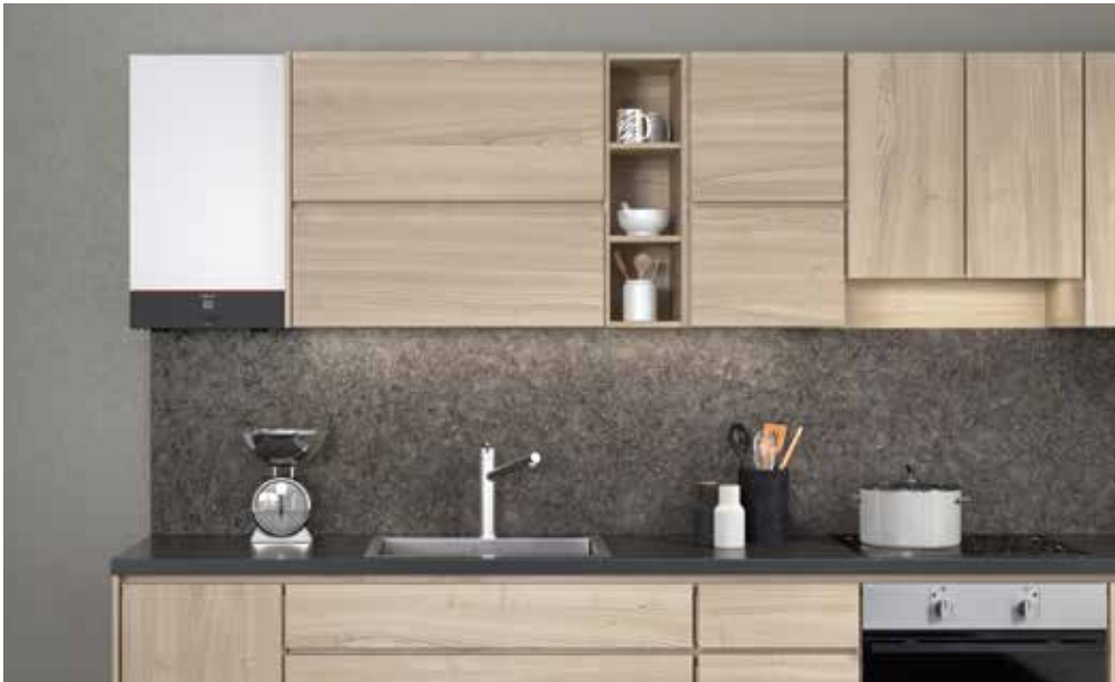
Vitodens 025-W featuring an attractive design in Vitopearlwhite

Compact and efficient wall mounted gas condensing boilers with a very attractive price/performance ratio